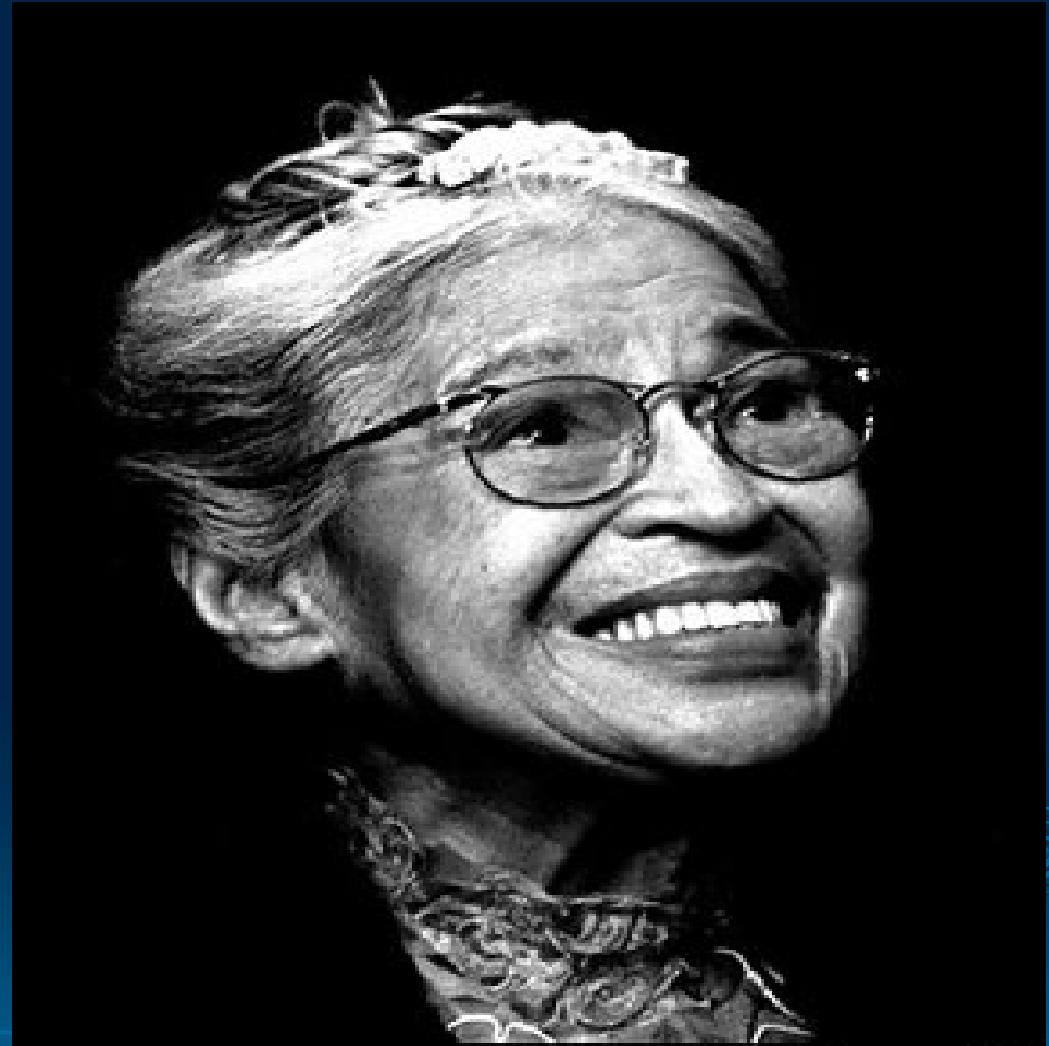
Paul Sancya / AP